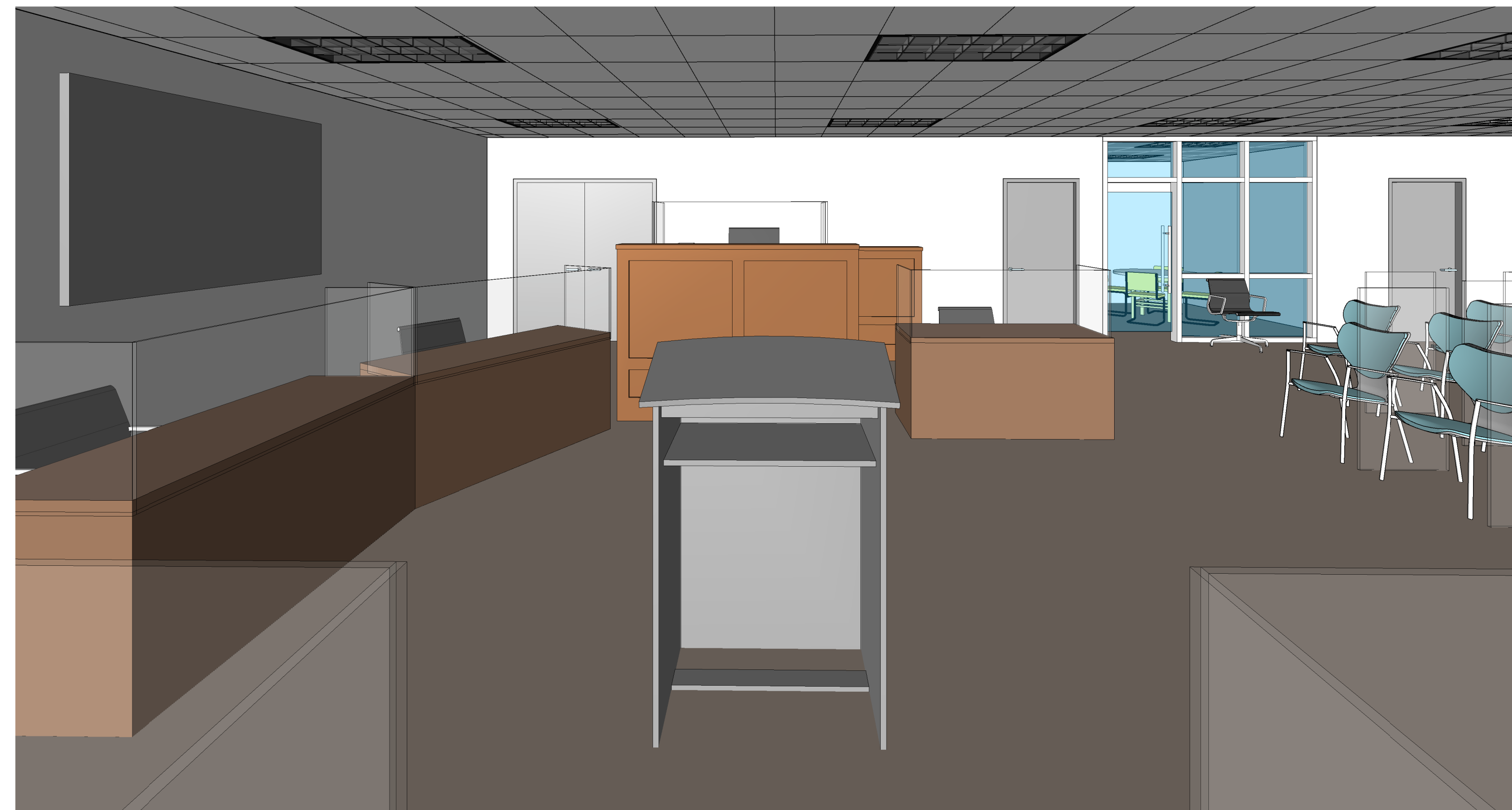
4 JURY COURT - ATTORNEY VIEW SCALE: