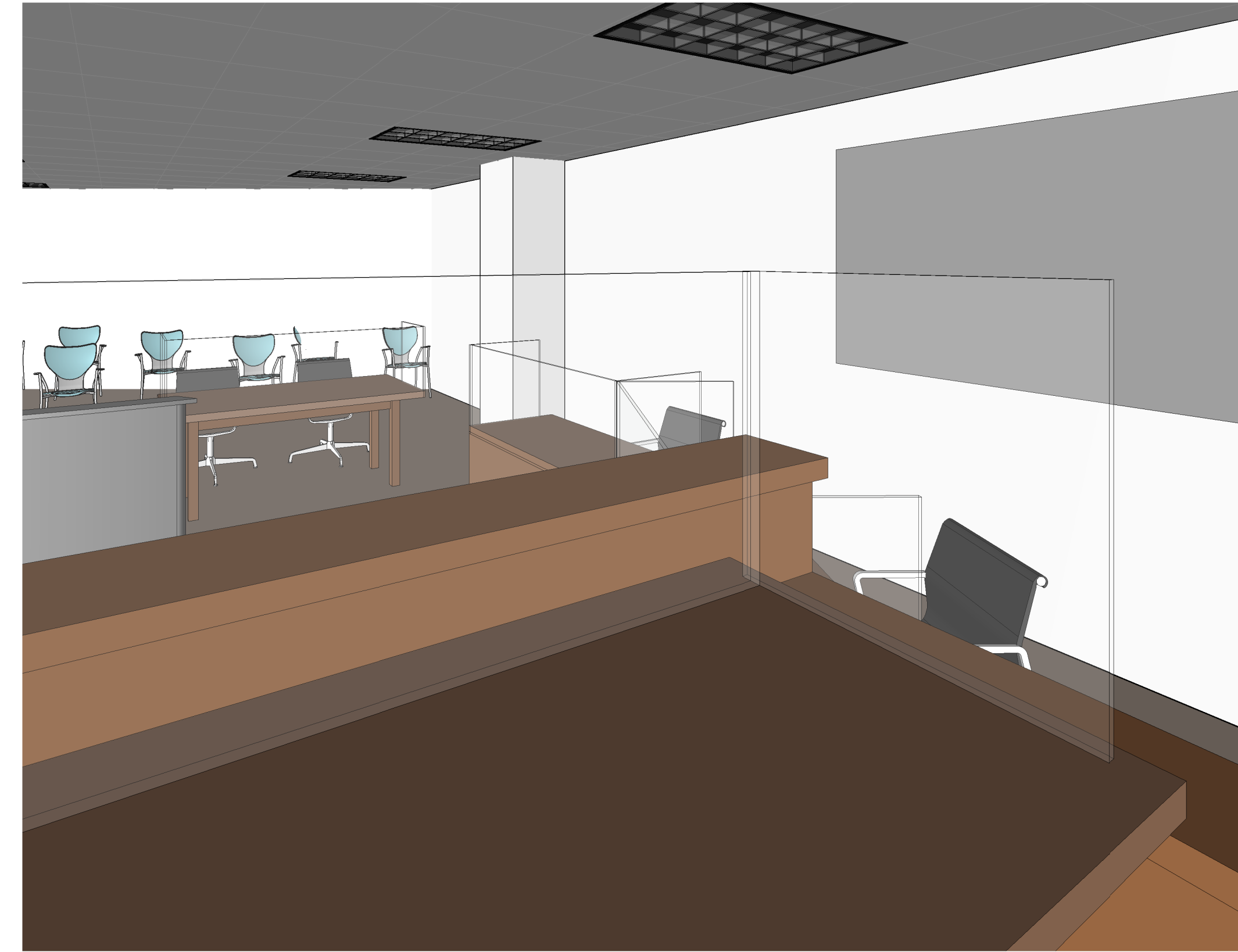
2 JURY COURT JUDGE VIEW 2 SCALE: