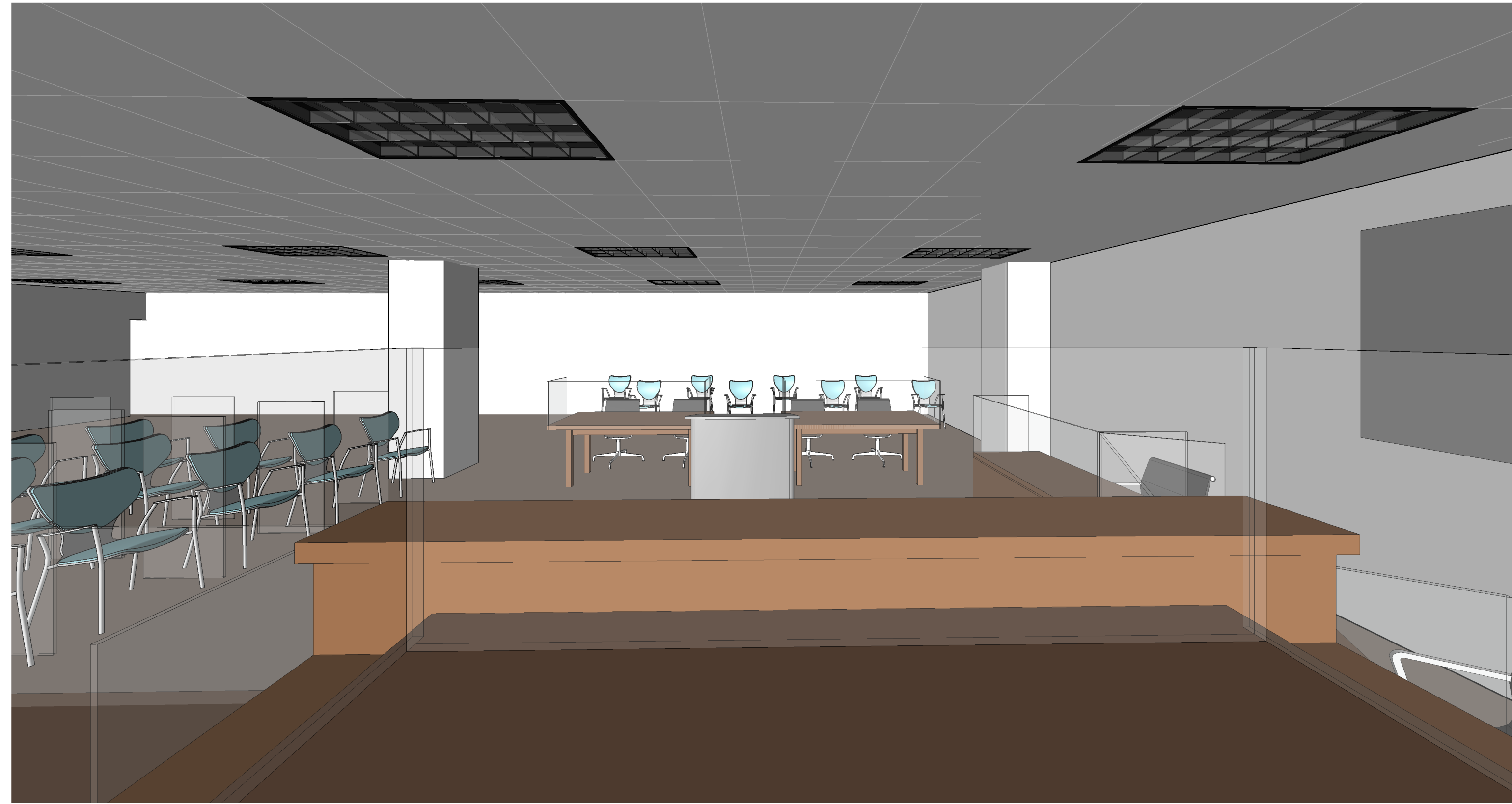
1 JURY COURT JUDGE VIEW 1 SCALE:

10/7/2020 3:49:58 PM C:\Users\wregan\Documents\20048_FOCO Courtroom Conversio_ARCH_RVT19C_wregan@jericho-design.com.rvt